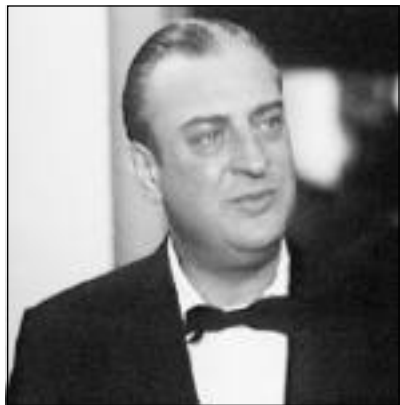
Rodney Dangerfield: He has our respect.

For the first time in his life, he left relaxed and peaceful, and had a sense of well-being. That night marijuana became a new friend that would be in Rodney's life for the next 62 years.